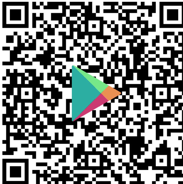
Figure 6: WE-SensorBLE in Google Play Store