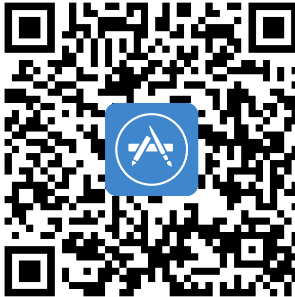
Figure 5: WE-SensorBLE in Apple App Store